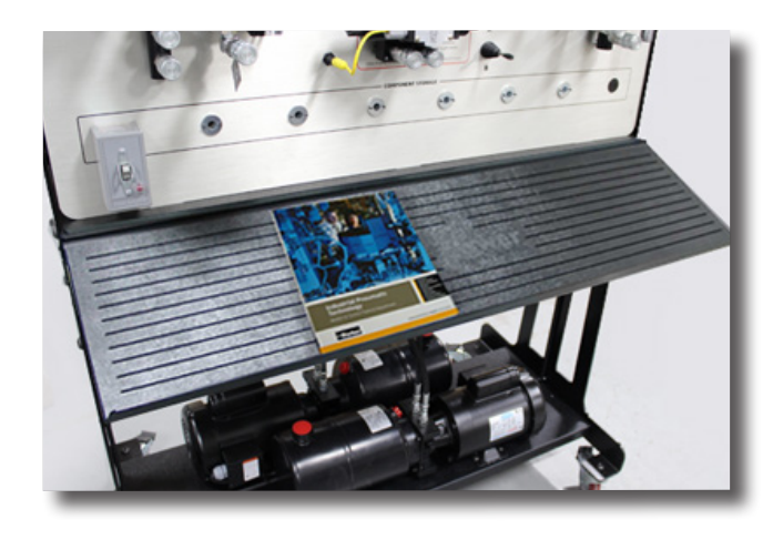
Spacious front tray with lip allows students to build systems while working with their books and manuals