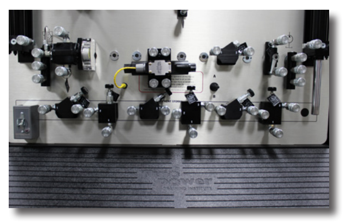
Component storage slots on front of trainer allow quick and easy access to most commonly used components