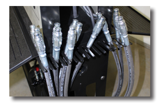
Convenient hose storage on both sides of the trainer keeps hoses organized and out of the way