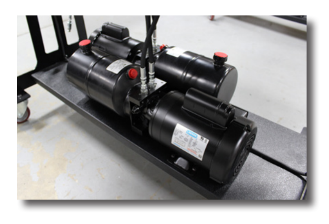
Power unit and self-contained reservoir is located at the bottom of the trainer.