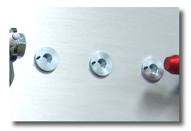
Unique valve locking design allows for easy on/off installation of valves and components